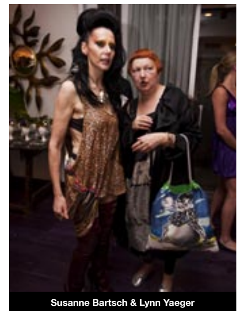
Susanne Bartsch & Lynn Yaeger