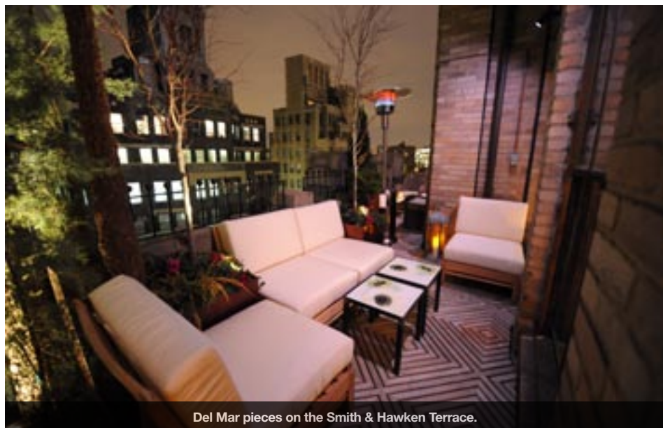
Del Mar pieces on the Smith & Hawken Terrace.