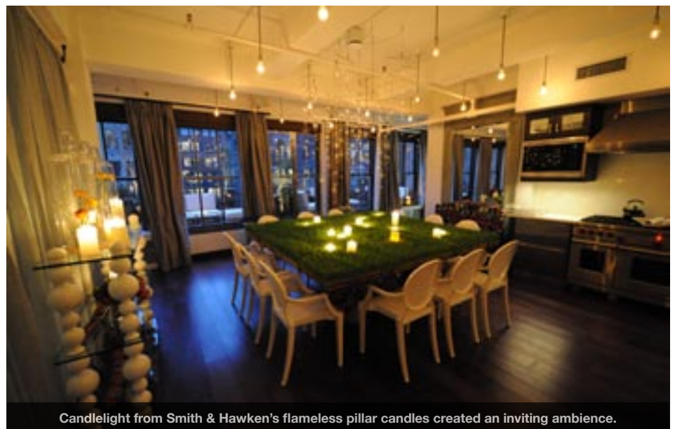
Candlelight from Smith & Hawken's flameless pillar candles created an inviting ambience.