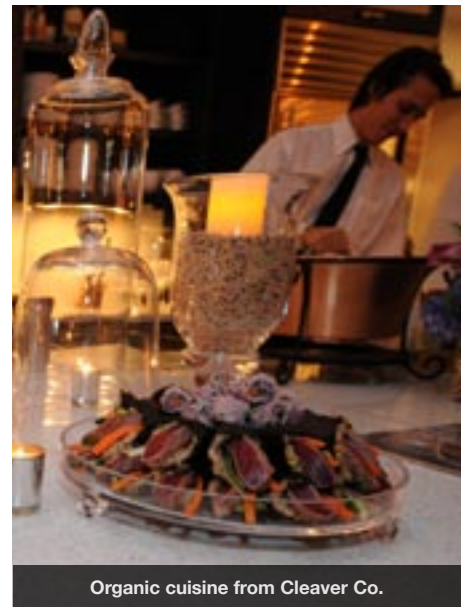
Organic cuisine from Cleaver Co.