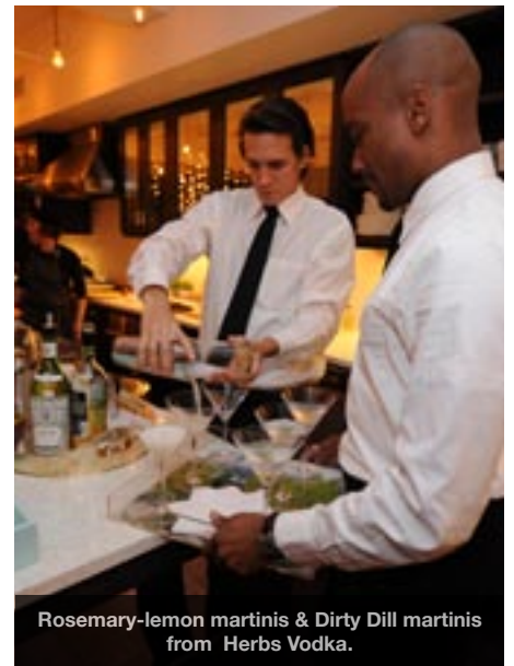
Rosemary-lemon martinis & Dirty Dill martinis from Herbs Vodka.