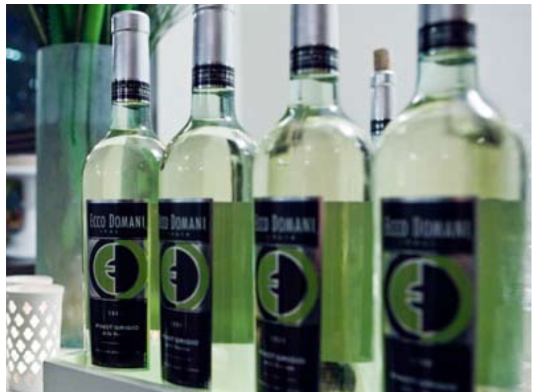
Pinot Grigio for a Soothing Spa Night.