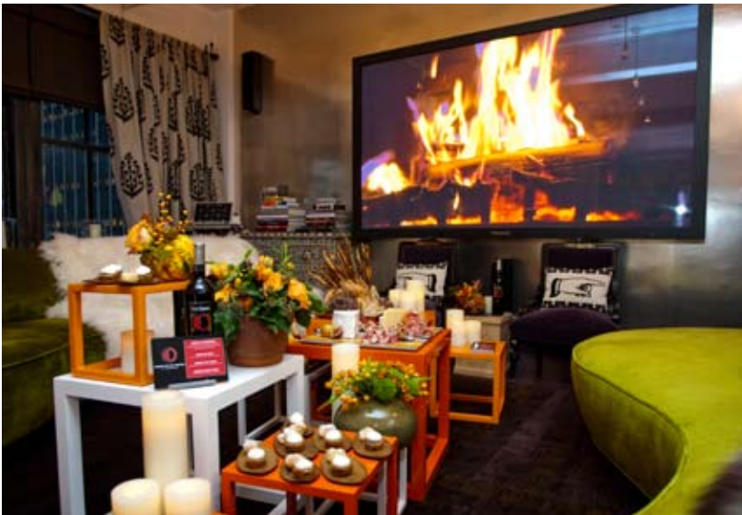
An At-Home Autumn Gathering.