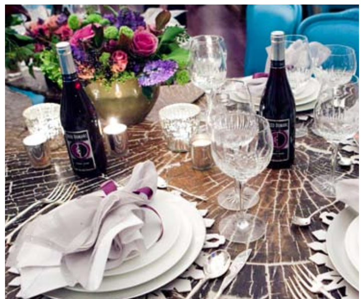
A Chic Holiday Soiree.