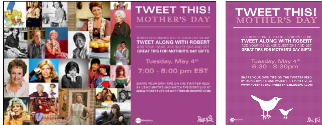
the invite and alert sent out to editors and media guests